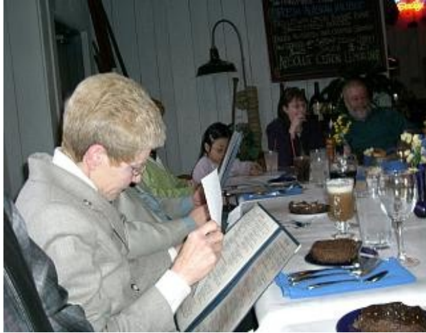
Dee checking out the menu