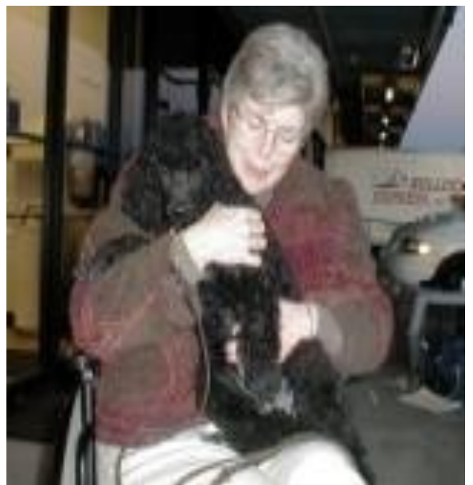
When he arrived as a baby. Instant love