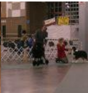
Standard Poodle Australian Shepherd Boxer