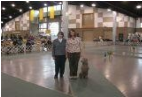
TC OTCH Regan's Rip Stop UDX4 VCD2 TDX HH Weimaraner