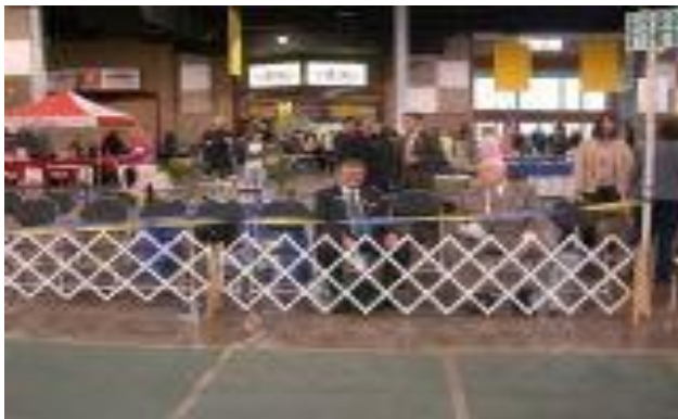
Roped off section for Judges to watch Groups