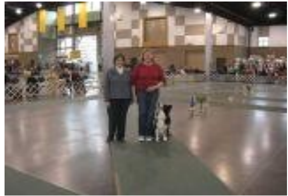
Ch OTCH Darkwind's Mirage of Blackrock UDX2 RE NA NAJ Border Collie