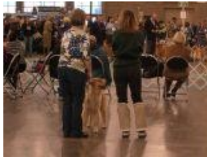
Lots and lots of Goldens