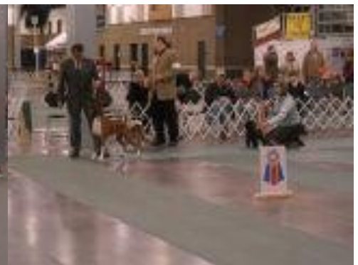
Bull Terrier Affenpinscher