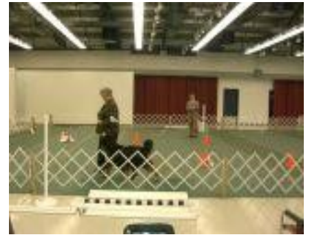
In the Pavilion Obedience