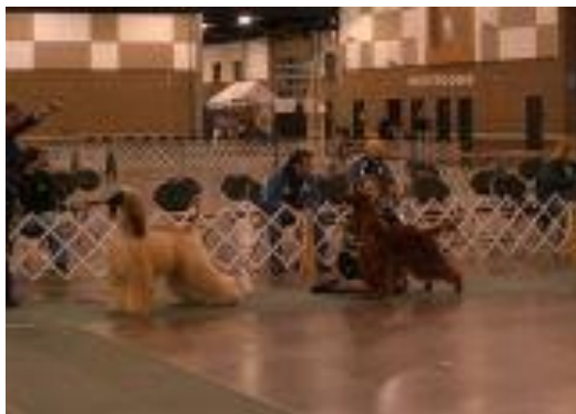
Afghan, Irish Setter