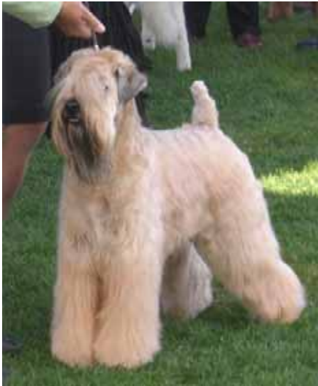
SOFT COATED WHEATEN