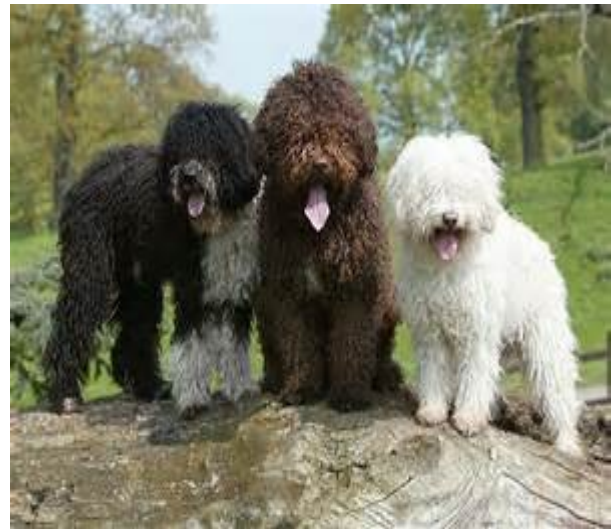
Spanish Water Dogs